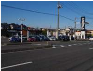
LIBERALA Iruma Imported car specialty store